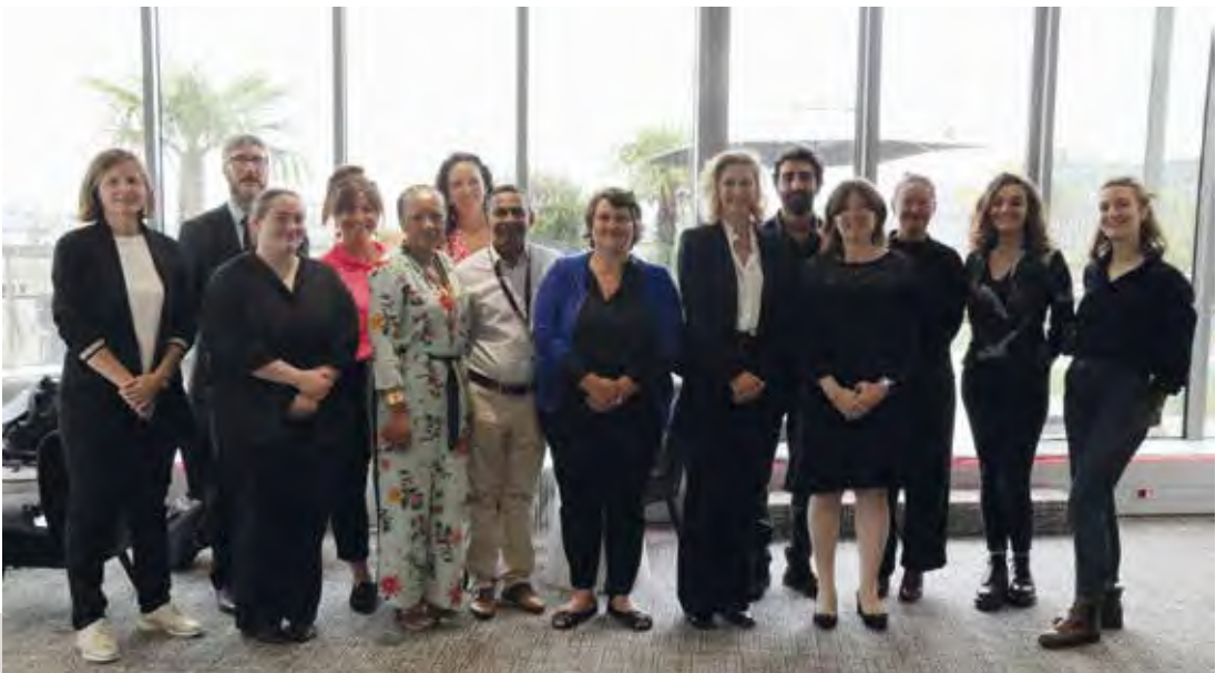
The international department team